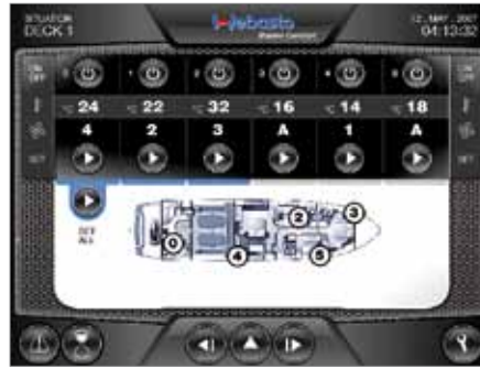
Customised to yacht