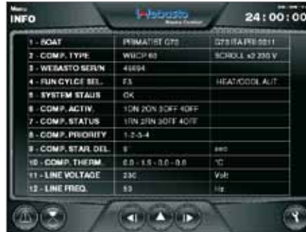
System information at a glance