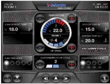
Ease of operation