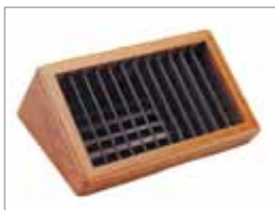
Webasto air outlet

Technical specifications are subject to change without prior notice.