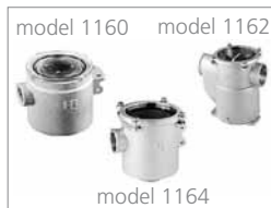
Webasto sea water strainers