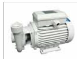
Selfpriming pump: WB4000 / 5600 / 8000 / 10500