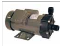
Pump: WB2500G to 5500G